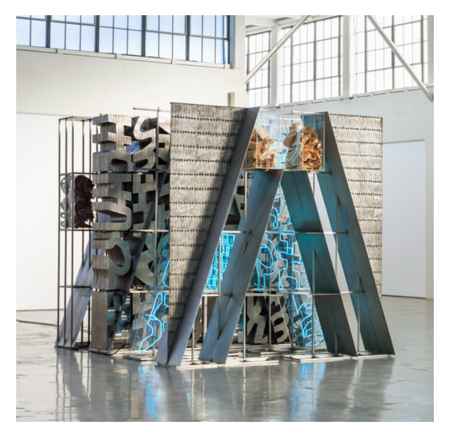
Chryssa & New York March 2—July 23, 2023

Dia Chelsea 537 West 22nd Street New York, New York